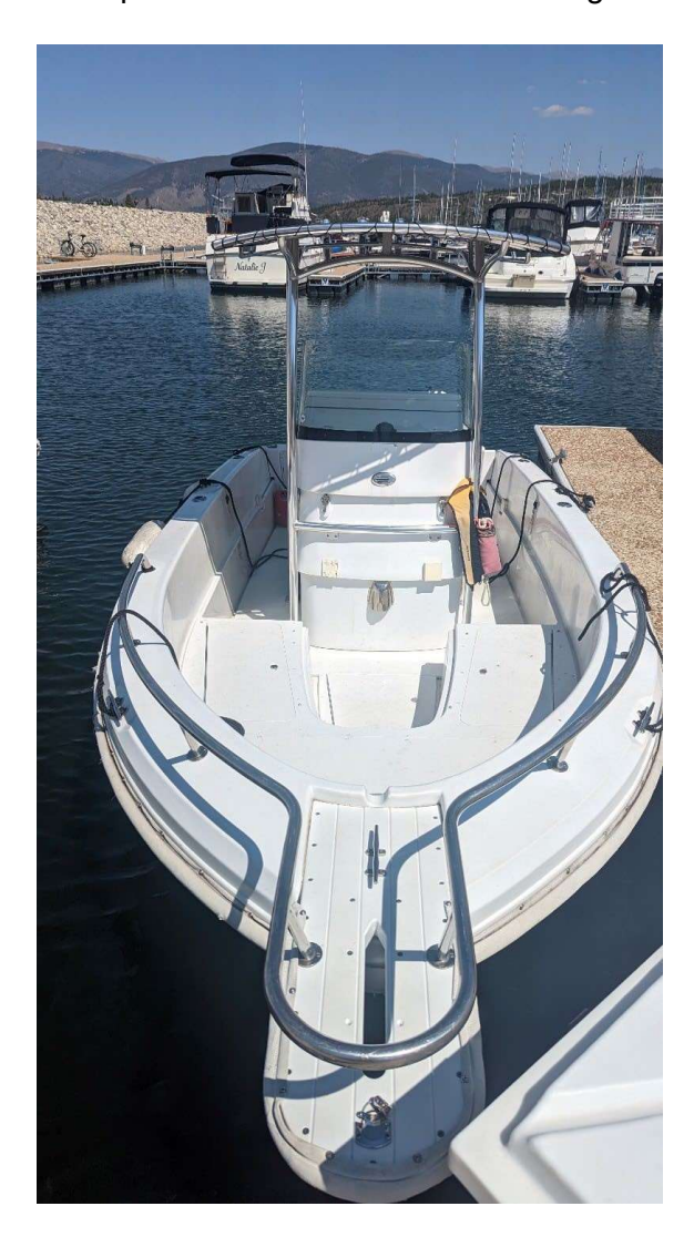
Photo 1 : FBM's current rescue boat. Note the Hull: Roto Molded Polyethylene. The roto-molding (rotational molding) process used to mold the Triumph boats is essentially the same as that used to make molded kayaks and all kinds of other products, except in this case it's on a pretty big scale. However, over time the mold and integrity of the boat's shape change, making it less operable and efficient when driving it.

Below are photos of the current and new rescue boats for the Frisco Bay Marina (FBM).